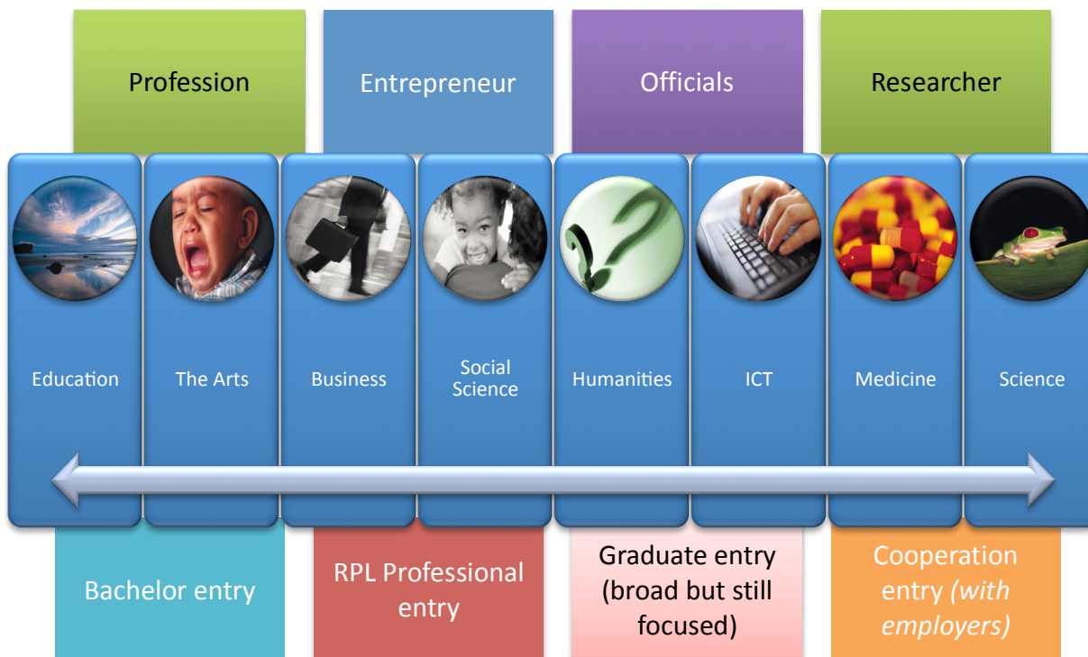
Figure 6 Ways in and out of the Swedish master programme

The open higher education system, that is characteristic of Swedish higher education, entails some difficulties with the statistical description of the students' periods of study. Such descriptions have